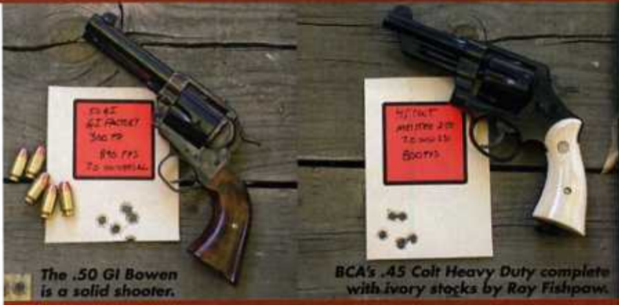
The .50 GI Bowen is a solid shooter.

Bowen offers unique services for customizing Ruger single action and