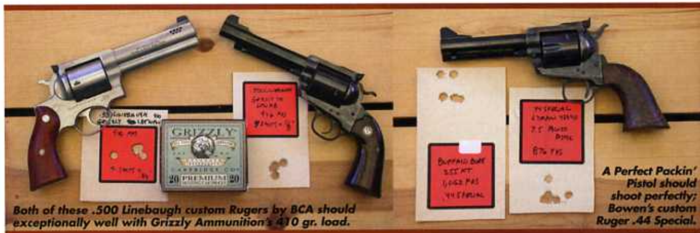
Both of these .500 Linebaugh custom Rugers by BCA should exceptionally well with Grizzly Ammunition's 410 gr. load.