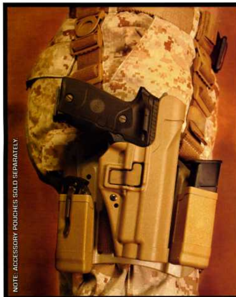
NOTE: ACCESSORY POUCHES SOLD SEPARATELY.

Both .500 sixguns were test-fired with Grizzly Ammunition's 410 gr. plain-based LFN bullet rated at 900 fps. This is not what you would call a hot load, but