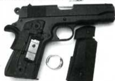
Magnetic smart gun kit for 1911 $89

Smart Lock Technology Inc. www.smartlock.com Tel: 604-551-8492