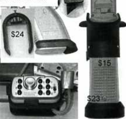
Mechanical Push Button Trigger Lock $19