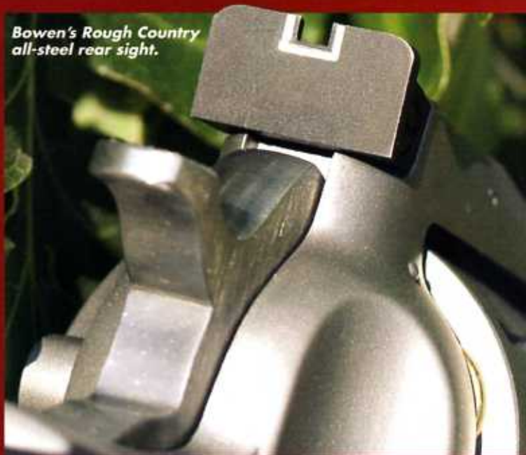
Bowen's Rough Country all-steel rear sight.