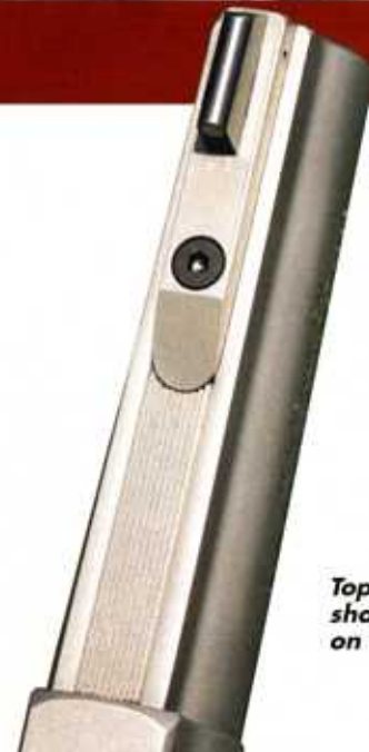
Top view of barrel showing XS big dot on Weigand base.